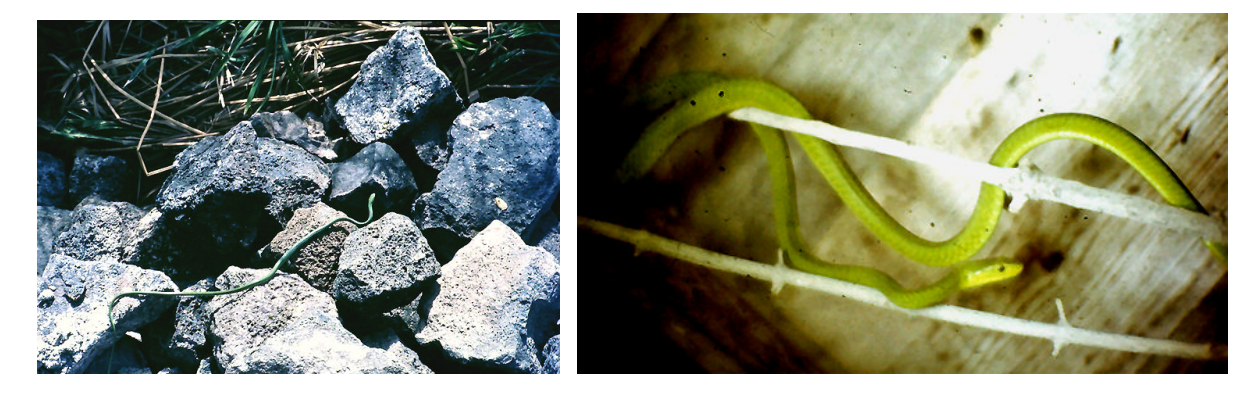
Left and right green snake yet one never knows is it a green mamba, boomslang or just an ordinary house snake.

Ljiljana never found out who scooped out all seeds of paprika and tomato she had planted recently. On the other hand the number of encounters with snakes increased. At first our gardeners Ngoa (a sling expert) and Mwachiro (our "all round man") just killed any they got across. Ljiljana learned to live with nyokas (= snake) menace and she caught one in a glass and proudly presented it to René. He just looked at it and let it free saying "kali kidogo!" (= little dangerous) disappointing Ljiljana a bit. Few days later Ljiljana called René instantly as Ngoa noticed a large black mamba coiled in large pot. This time René was too happy with the catch that he placed it in the new terrarium yet under construction. Vesna almost got slapped when she came home prancing with a "snake" made of plastic that was rather too realistic. The various plastic toys (snake, tarantula etc.) were a "great fun" in her class but not with Ljiljana.